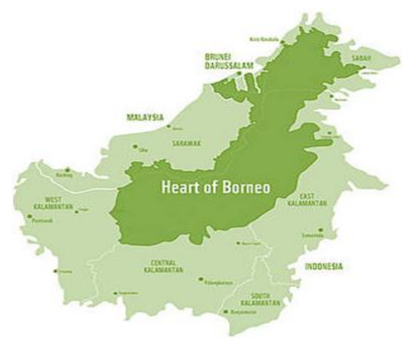
Figure-1. Boundary line of Heart of Borneo. Adapted from SEDIA (2010)

The boundary line also involves the area for the habitat of orangutans of various species such as Pongo Pygmeaus Pygmeaus (north of the Kapuas River, Pongo Pygmeaus Wurmbii (south of the Kapuas river and Central Kalimantan dan Pongo Pygmeaus Morio East Kalimantan and Sabah) (Groves, 2001).